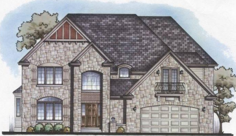
FRONT ELEVATION APPROXIMATELY 3,500 SQUARE FEET